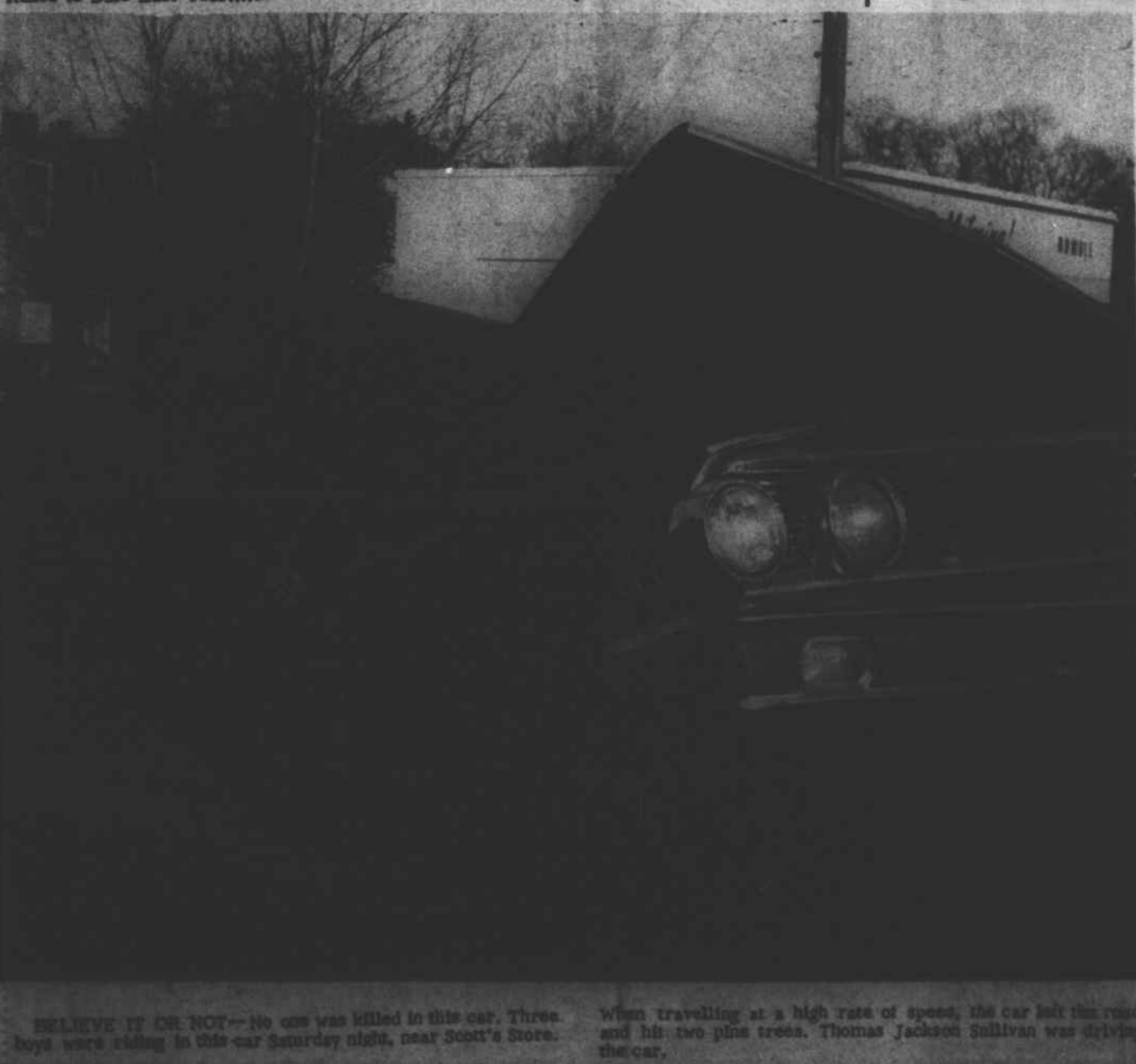
BE LIEVE IT OR NOT--No one was killed in this car. Three boys were riding in this car Saturday night, near Scott's Store.