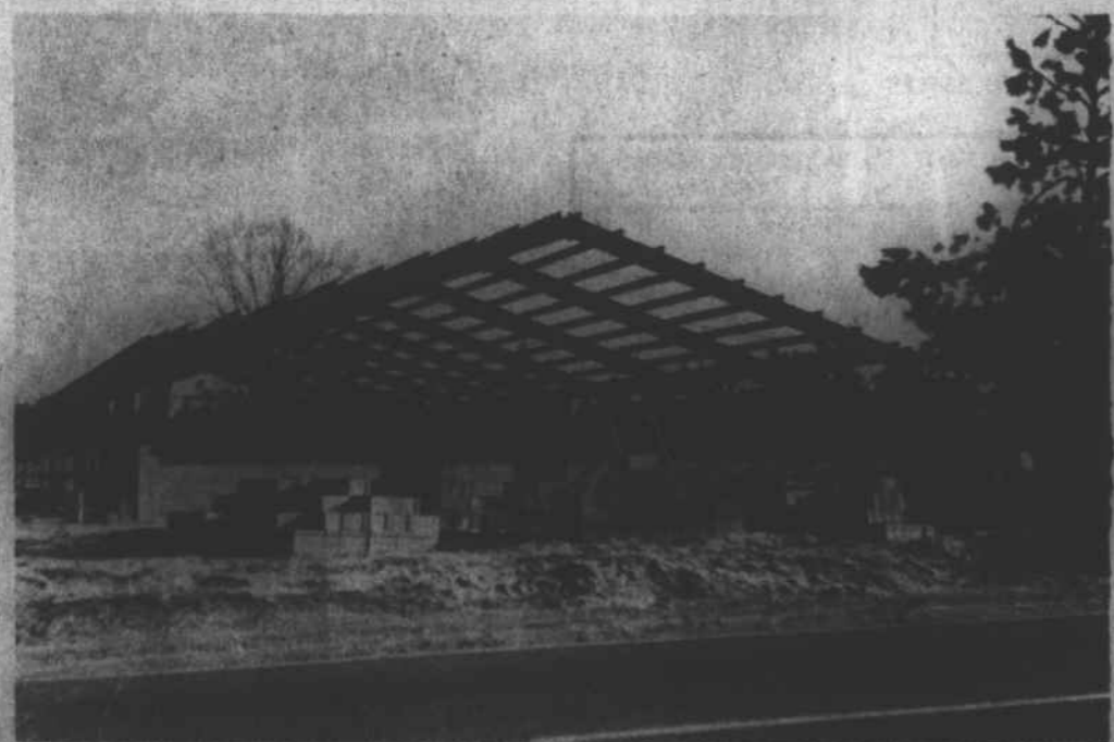
THE FRAME OF THE DUPLIN COUNTY SCHOOL GARAGE which is being built on highway 11, near James Sprunt Institute. The garage which is now behind Kenansville Grammar School will move to this new site as soon as the building is completed. School buses will be repaired and stored at the new garage.