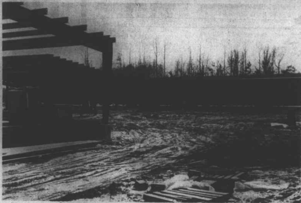
THIS IS THE ADMINISTRATIVE BUILDING OF JAMES SPRUNT INSTITUTE—which is being built on highway 11 toward Wallace. This is the first building of several which will be constructed to house the Community College. It is

Seven of the eleven employees of Pink Hill Supply are Veterans.