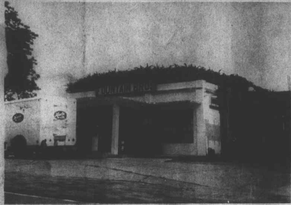
It is not a photographers trick, but a real honest-to-goodness live and growing corn crop, just one of the many interesting things that Duplin County has to offer. This gem came from Fountain Town where the Fountain Brothers find it necessary to increase their farming space. See story on inside front section. (Photo by Ruth Wells).