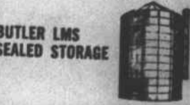
BUTLER LMS SEALED STORAGE