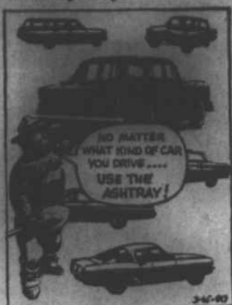
Care will prevent 9 out of 10 forest fires!