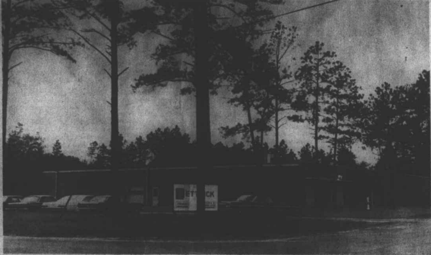
The Hettrick Company of Pink Hill, Manufacturers of Canvas sporting goods, is now in operation, providing employment for many local persons. The plant is located south of the Pink Hill School on New Street where Open House will be held Sunday, September 10th from 2 to 5 p.m. (Photo by Ruth Wells).