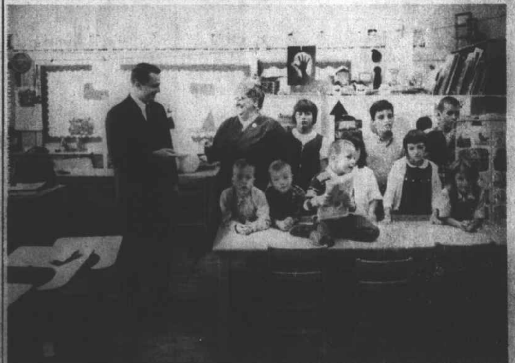
ROSE HILL JAYCEES PRESENT CHECK TO TRAINABLE CLASS.