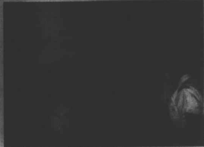
Cadettes serving refreshments after ceremony.