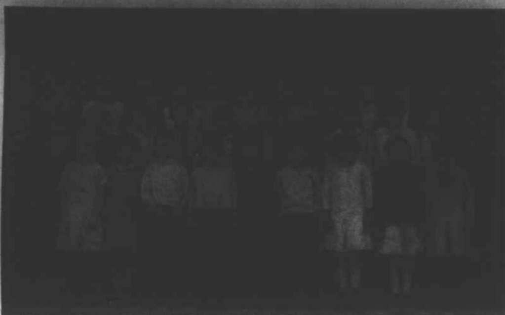
In The "Good Old Days"