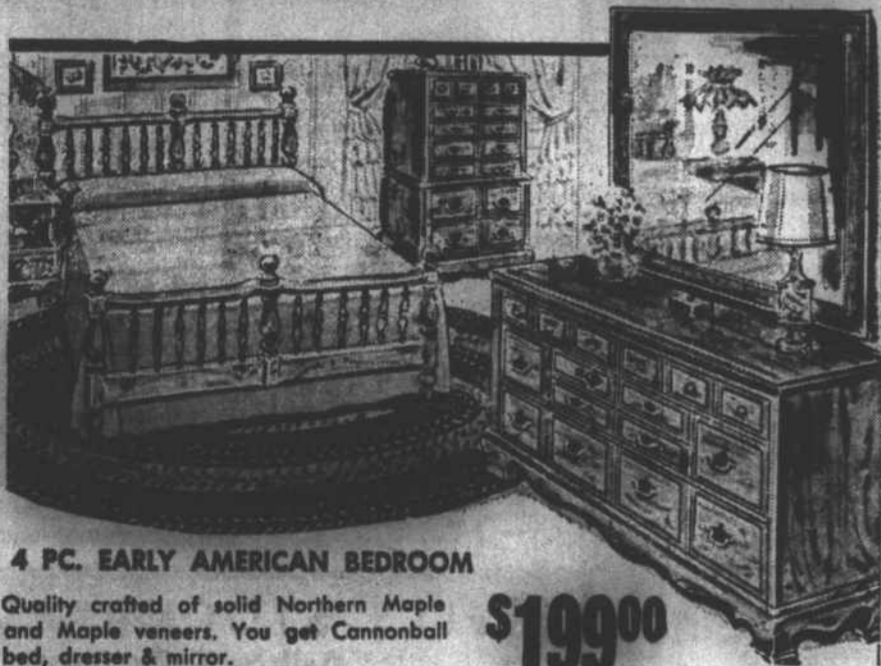
4 PC. EARLY AMERICAN BEDROOM

Quality crafted of solid Northern Maple and Maple veneers. You get Cannonball bed, dresser & mirror. Chest on chest $79.95.