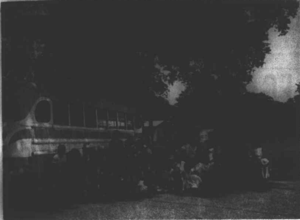
FIFTY THREE SECOND GRADERS JUST RETURNED FROM THEIR ESEA TRIP