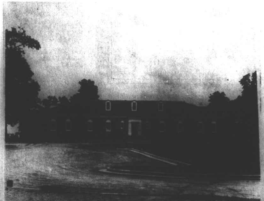
Duplin County Welfare building, beautiful in Colonial splendor, is rapidly approaching completion. The building is scheduled to be turned over to the county for use in August.