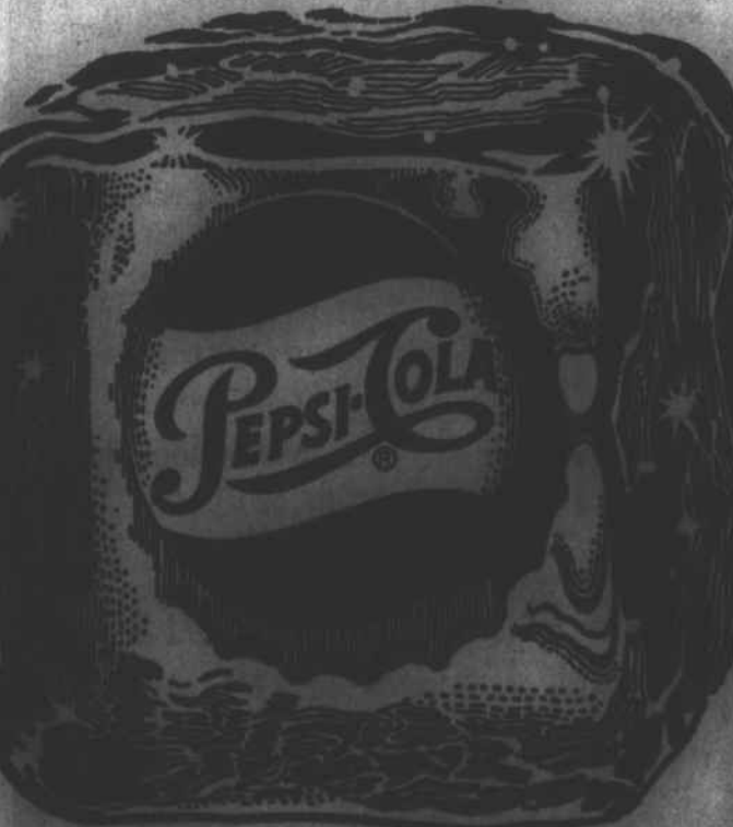
Bottled By Pepsi-Cola Bottling Co. of Goldsboro Under Appointment From Pepsico Inc. New York, N.Y.