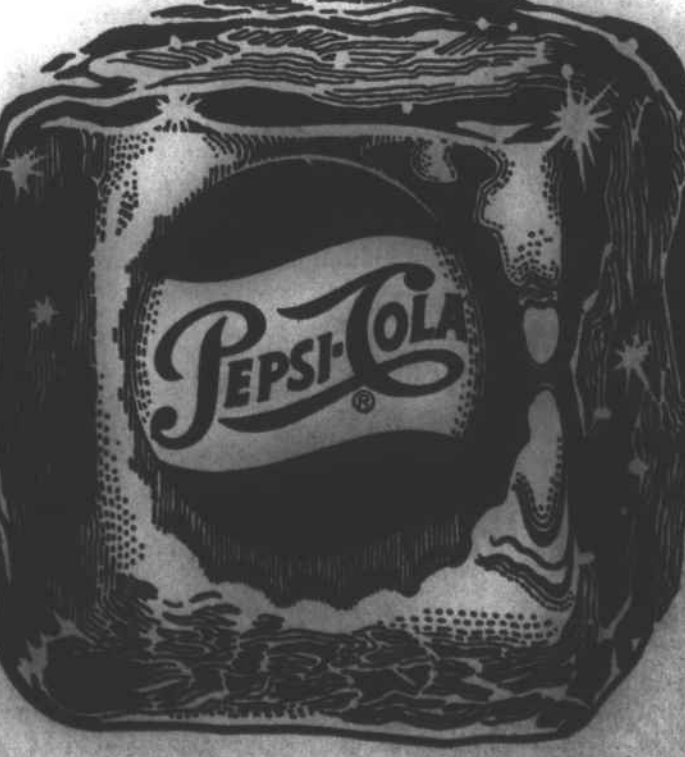
Bottled By Pepsi-Cola Bottling Co. of Goldsboro Under Appointment From Pepsico Inc. New York, N.Y.