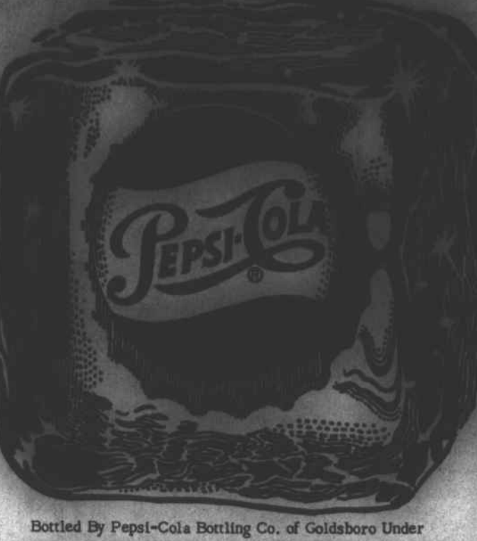
Bottled By Pepsi-Cola Bottling Co. of Goldsboro Under Appointment From Pepsico Inc. New York, N.Y.