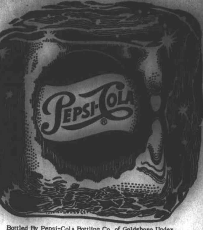
Bottled By Pepsi-Cola Bottling Co. of Goldsboro Under Appointment From Pepsico Inc. New York, N.Y.

E. W. GODWIN'S SONS Call Us If You Need Lumber Or Building Materials From Forest - To Mill - To You! WALLACE, N. C. Phone AT5-2908 WILMINGTON, N. C. Phone R02-7747