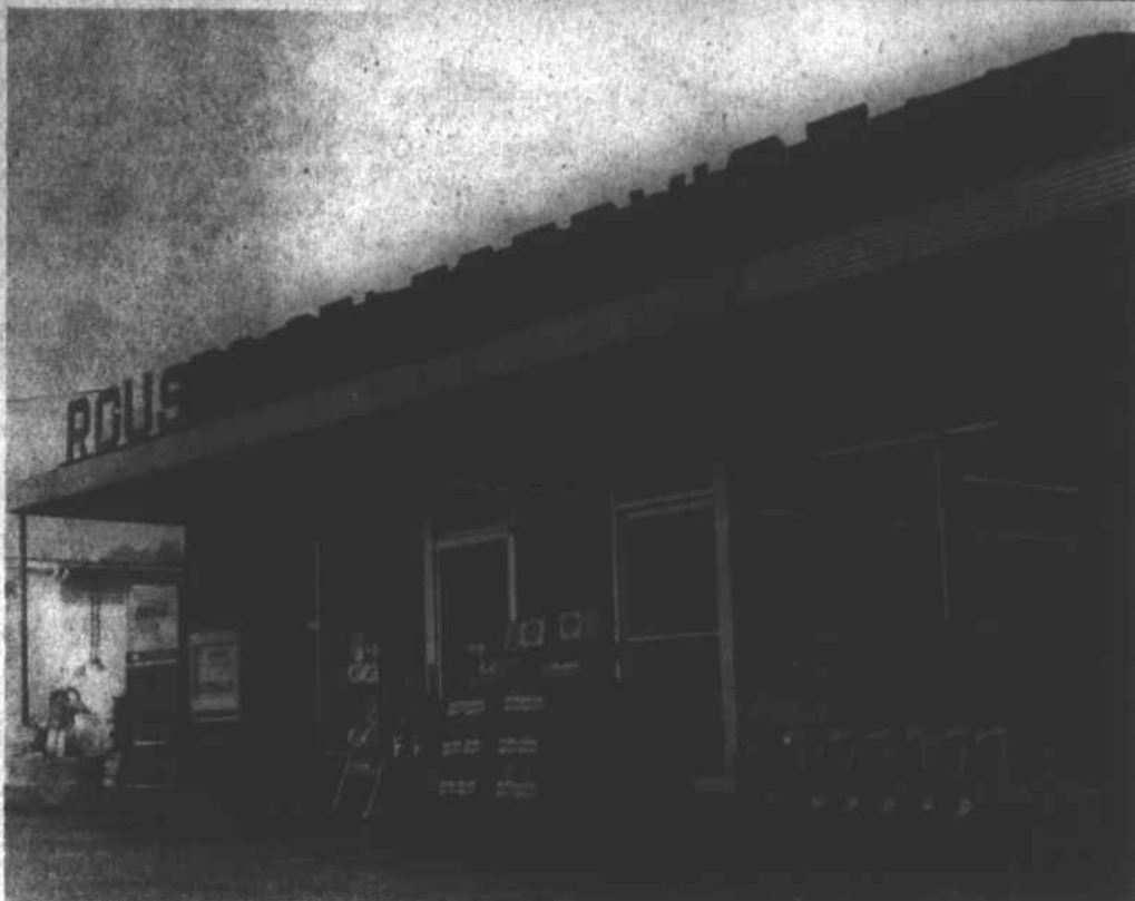
Rouse's Self Service in Rose Hill is featuring, among their many specials this week end, Frosty Morn Hot Dogs and Pepsi's!