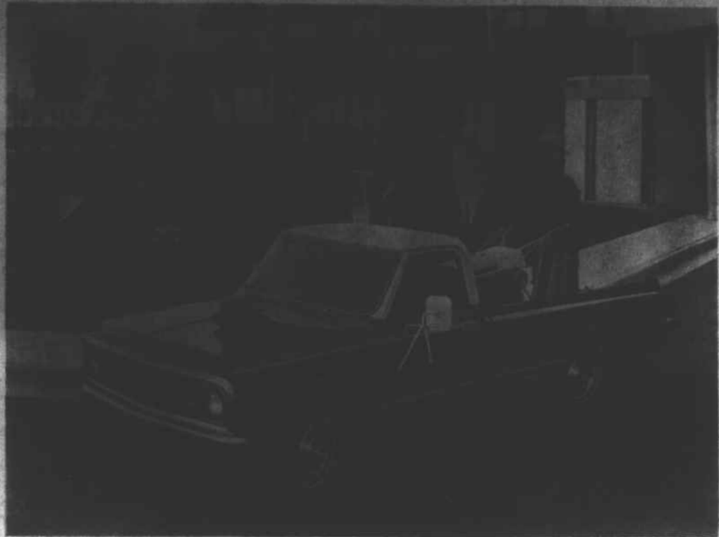
1969 Chevolet Light-Duty Pickup Truck