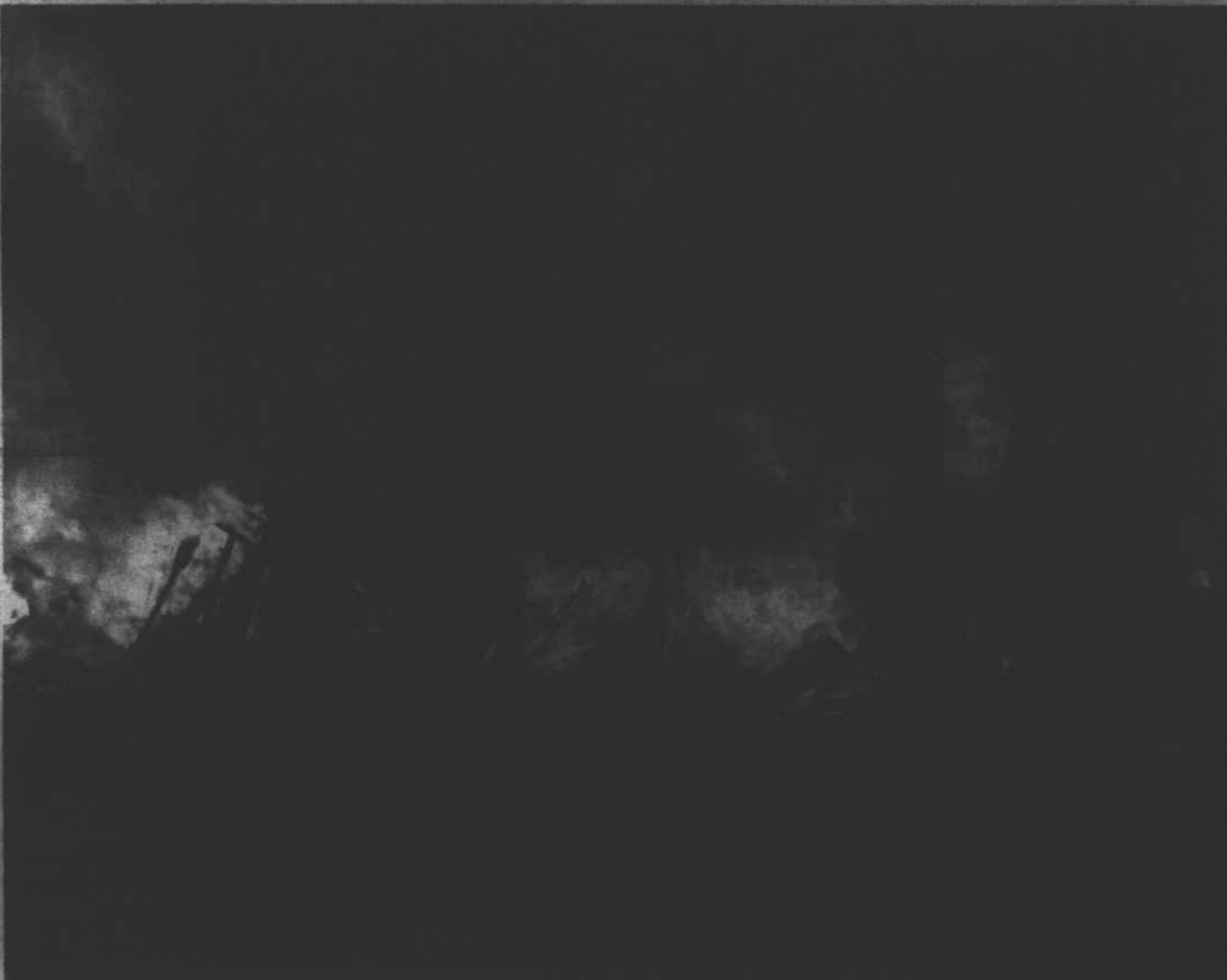
Fire of undetermined origin destroyed the frame building owned by Duplin County Board of Education and occupied by the Maintenance Department. Firemen fought to save the building which contained various paper products which fed the flames. The Kenansville Fire Department assisted by the Warsaw Department contained the fire to the one building.