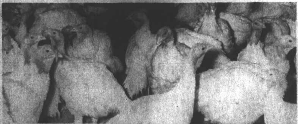
TURKEYS GROWN BY JOHNNY SMITH, BOWDENS