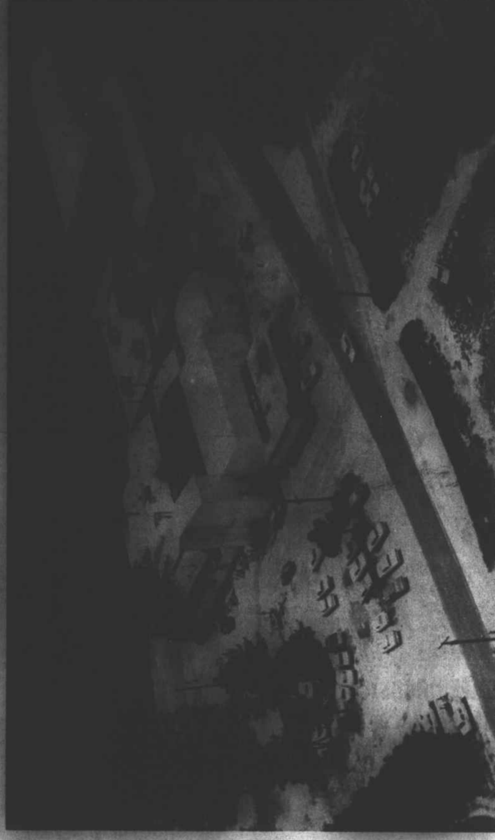
TURKEY PROCESSING PLANT - WHERE JOHNSON TURKEYS ARE MADE READY FOR MARKET. - 1,000,000 LBS. PER WEEK.