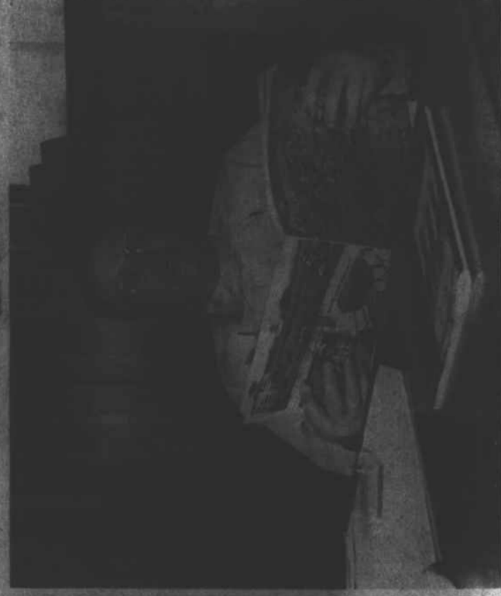
RENDERING PLANT - MANUFACTURERS 200 TONS OF POCKTRY BY - PRODUCT MEAL PER WEEK - 100 TONS OF POULTRY LIQUID FAT WHICH IS REBLENDED INTO FINISHED FEED.