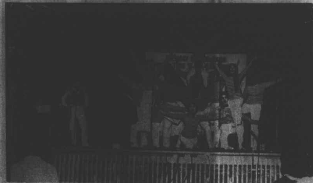
"THE PERFORMANCE GROUP" entertains. A highlight of the District II FHA/HERO Rally held Friday at Kenan Auditorium was a musical