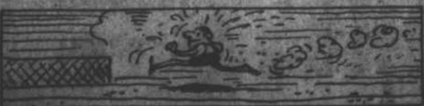
The first person on record to run a mile in under 4 minutes was Roger Bennett, who did it in 1954 in 3 minutes, 59.4 seconds.