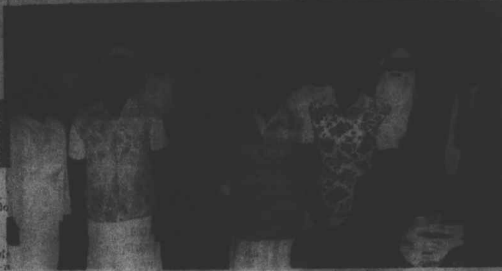
HELPERS - The above volunteer workers help serve the lunches each day.