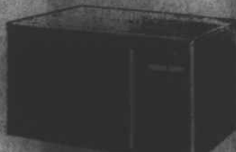
Panasonic NE-7800 MULTI-MATIC Microwave Oven with POWER SELECT and TEMP SELECT

With TERESA RIVERA- Panasonic Microwave Home Economist