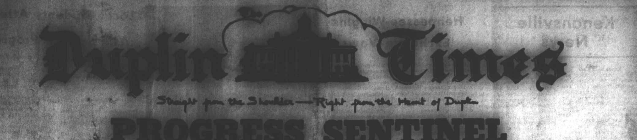
VOL. XXXXIII NO. 32