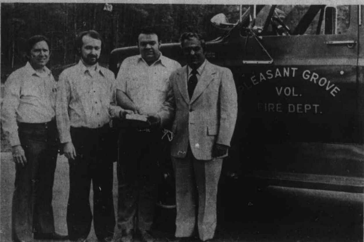
NEW FIRE TRUCK - Pleasant Grove Volunteer Fire Department has purchased a 1979 tank truck. The tank truck will be the fourth addition to the Pleasant Grove Fire Department since its beginning. The department now has two tank trucks, a pumper truck and a pump buggy. The fire department presently serves a four-mile radius and

In North Duplin, 50 students registered, 90 registered in East Duplin, and at James Kenan 85 students registered.