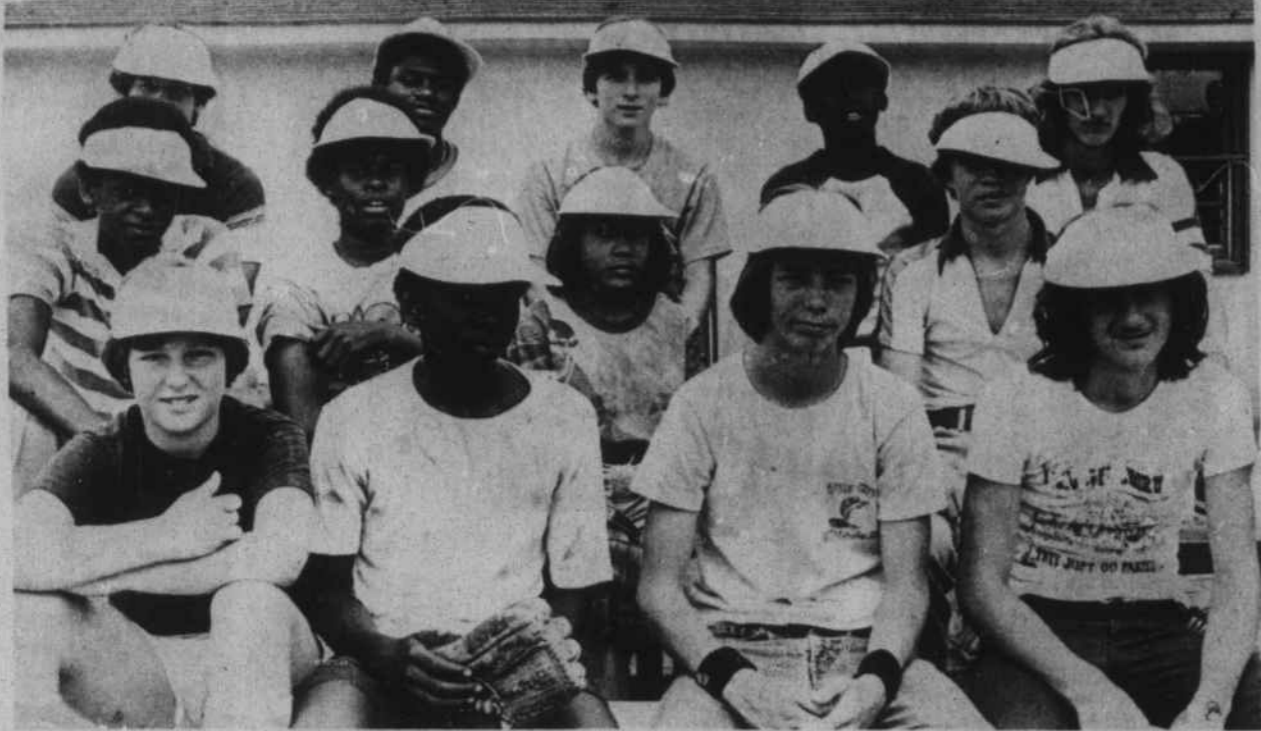
THE EIGHTH JUDICIAL DISTRICT WINS - The second annual softball and field day held between the Eighth and Fourth Judicial Districts was held last Friday in Kenansville. The Eighth Judicial District, made up of Lenoir, Wayne and Green counties, won the softball game against the Fourth District of Duplin, Sampson, Onslow and Jones counties. The teams are made up of young people who have come in contact with the juvenile court