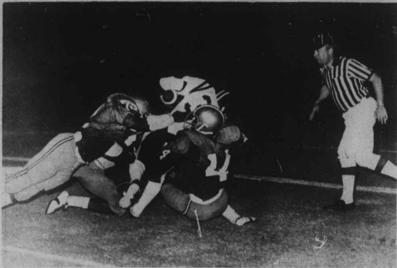
ND-JK In Action Friday Night