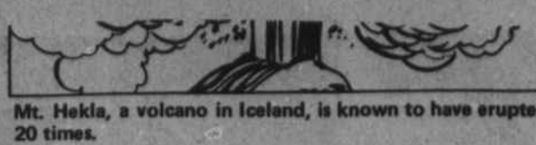
Mt. Hekla, a volcano in Iceland, is known to have erupted 20 times.