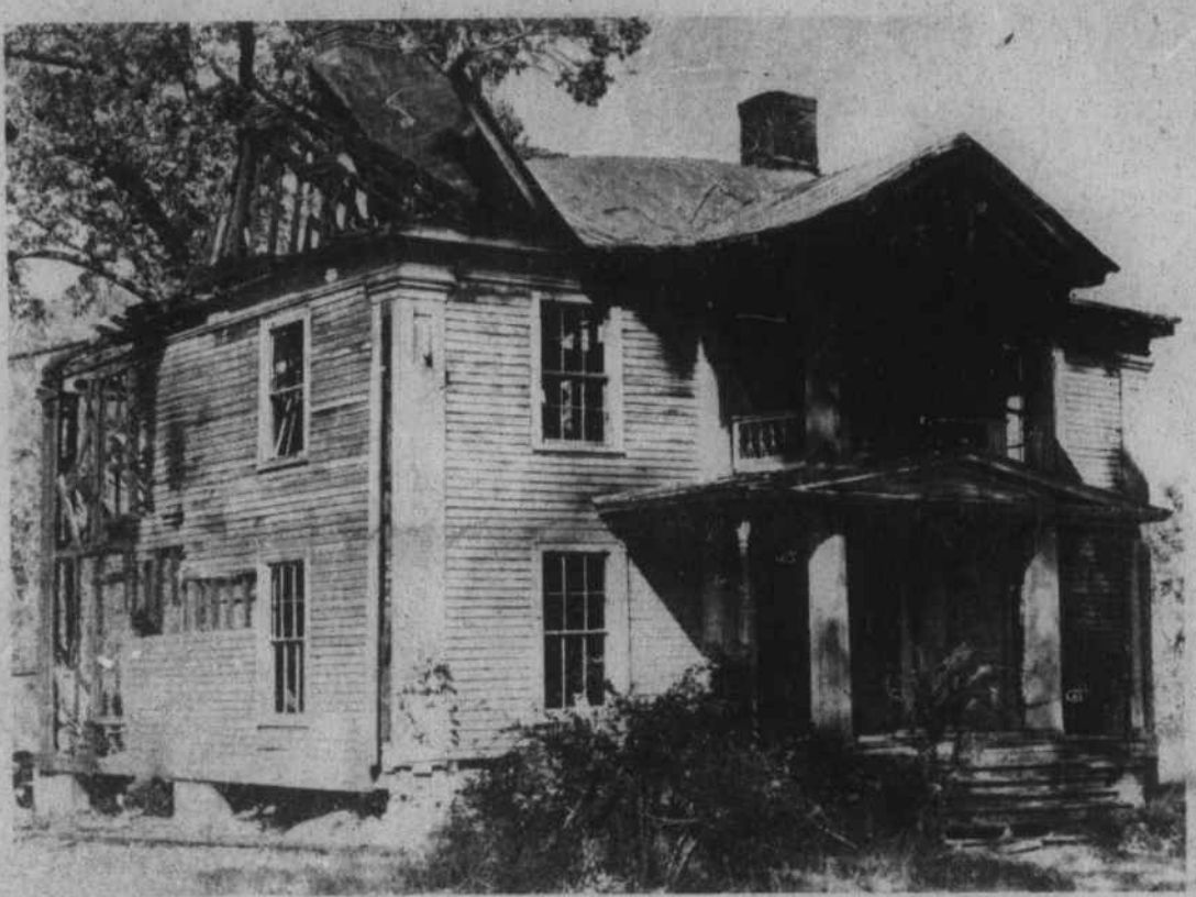
Historical home burns in Kenansville