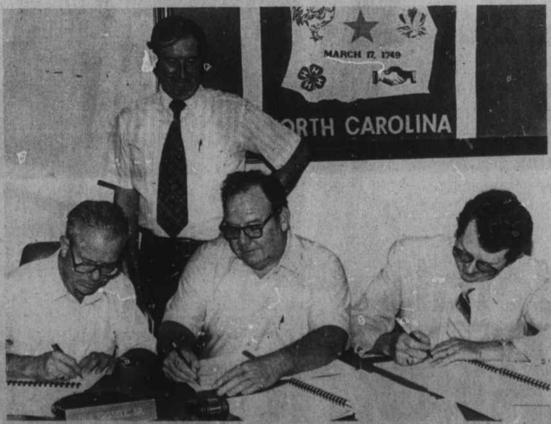
Muddy Creek project gets underway