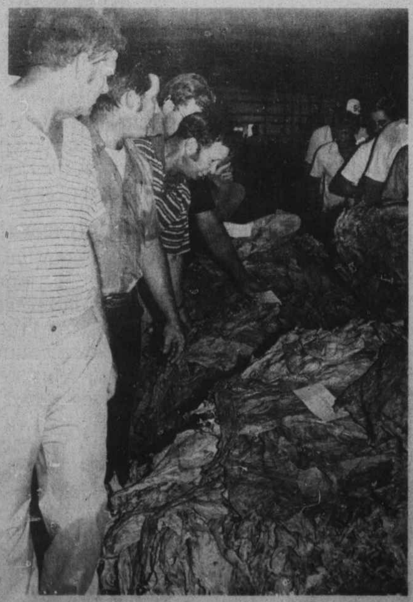
Duplin prices lead Eastern Tobacco Belt