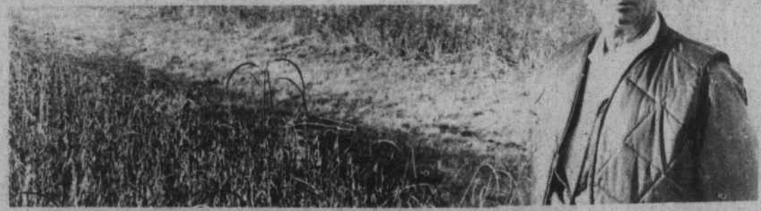
Boyce state conservation winner