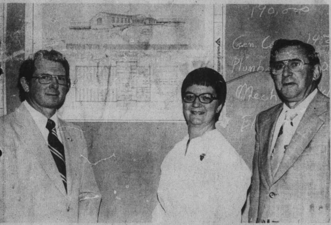
Duplin welcomes new librarian and facility