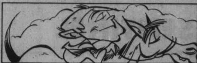
Children in Mongolia learn to ride a pony when they are about four years old.

The latest happenings between the school board and county commissioners. . . . The $125,000 transfer of money to help heat and keep Duplin County school buildings in good repair. . . . It would seem the county commissioners are more interested in the welfare of Duplin's school children than the school board. It reminds me of the story of the boy whose father gave him the family money to buy bread; however, the boy bought candy for himself instead. . . . Son-of-a-Gun. . . .