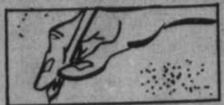
The average pencil will write about 30,000 words in its lifetime.

1,647 pounds — was cut in the general tobacco production quota reduction ordered by the secretary of agriculture in November. Last year the quota was 1,775 pounds. The town's tobacco quota is tied to a piece of land it purchased for an industrial development park.