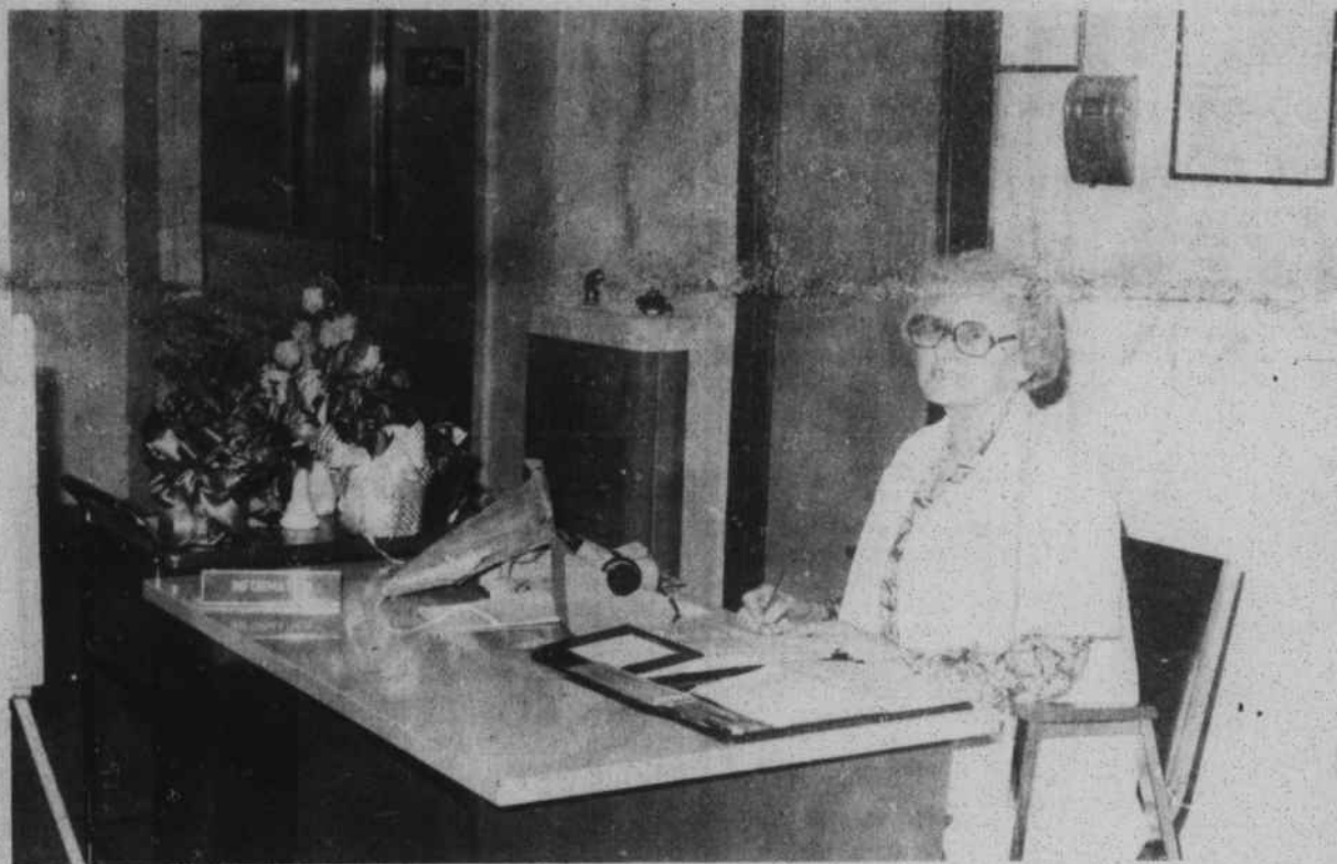
AUXILIARY CELEBRATES BIRTHDAY - Duplin General Hospital Auxiliary celebrates its first birthday this month with 51 members who give more than 250 hours per month