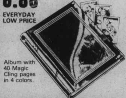
Album with 40 Magic Cling pages in 4 colors.