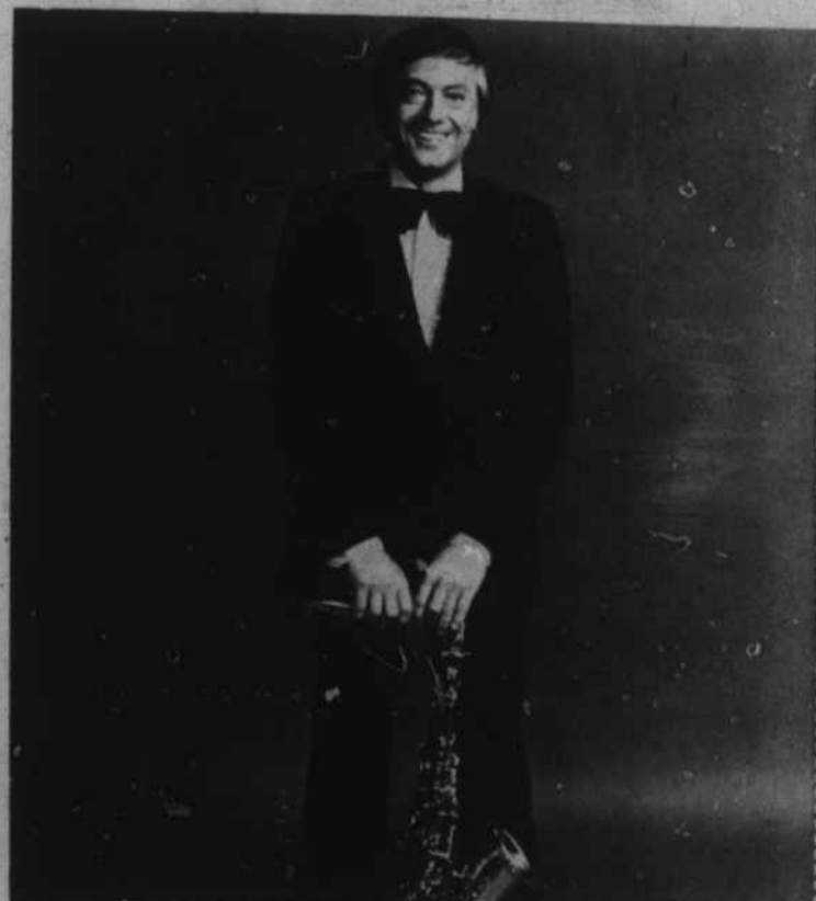
BOOTS RANDOLPH Sunday, December 5, 1982 7:00 P.M.

Nostalgic moments and present-day entertainment combine to create a program filled with a variety of rhythms that prove the good times are still here. Remember Maxene Andrews? After this program, no one in the audience is likely to forget her.