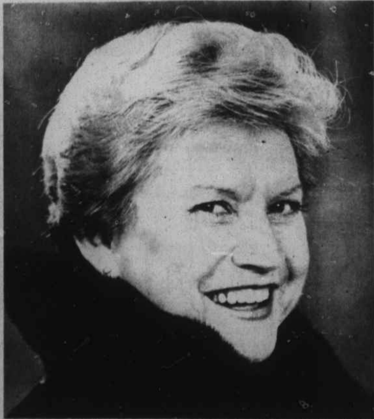
MAXENE ANDREWS Tuesday, October 12, 1982 8:00 P.M.

The North Carolina Symphony enriches the lives of North Carolina's citizens in cities and communities throughout the State through high-quality, live performances. It has one of the broadest and most intensive educational programs of any symphony in the country.