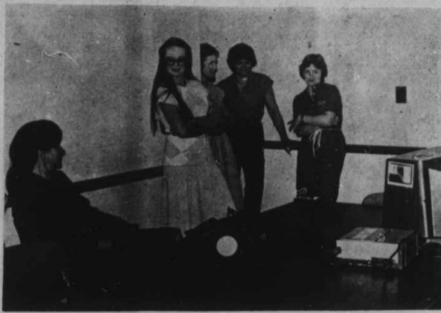
GETTING READY FOR THE DUPLIN AGRIBUSINESS FAIR - Murphy Farms, Inc. employees watch a video tape of the Murphy Farms operations to be shown at the Duplin County Agribusiness Fair. One of the many

Results Sept. 17 N. Duplin 21, Wallace-RH 0 James Kenan 21, Greene 0 Lakewood 32, Midway 13 Hobpton 28, S. Lenoir 23 E. Duplin 21, Union 16