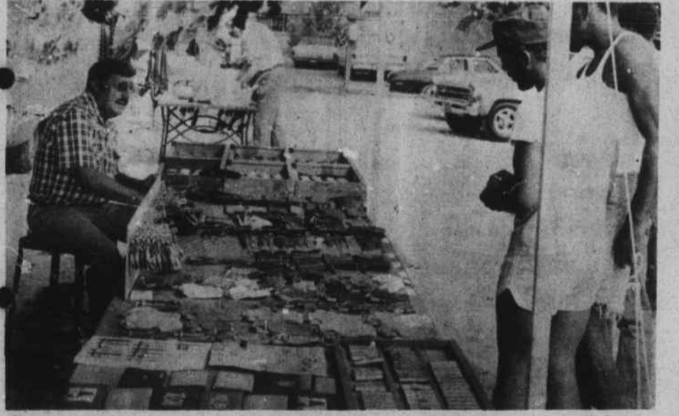
WARSAW FLEA MARKET - The Warsaw Chamber of Commerce sponsors a flea market each Thursday, Friday and Saturday.

PTA MEETING The first P.T.A. meeting of the school year has been scheduled for Monday, Sept. 27 at Pink Hill School at 7:30 p.m. Open house is planned.