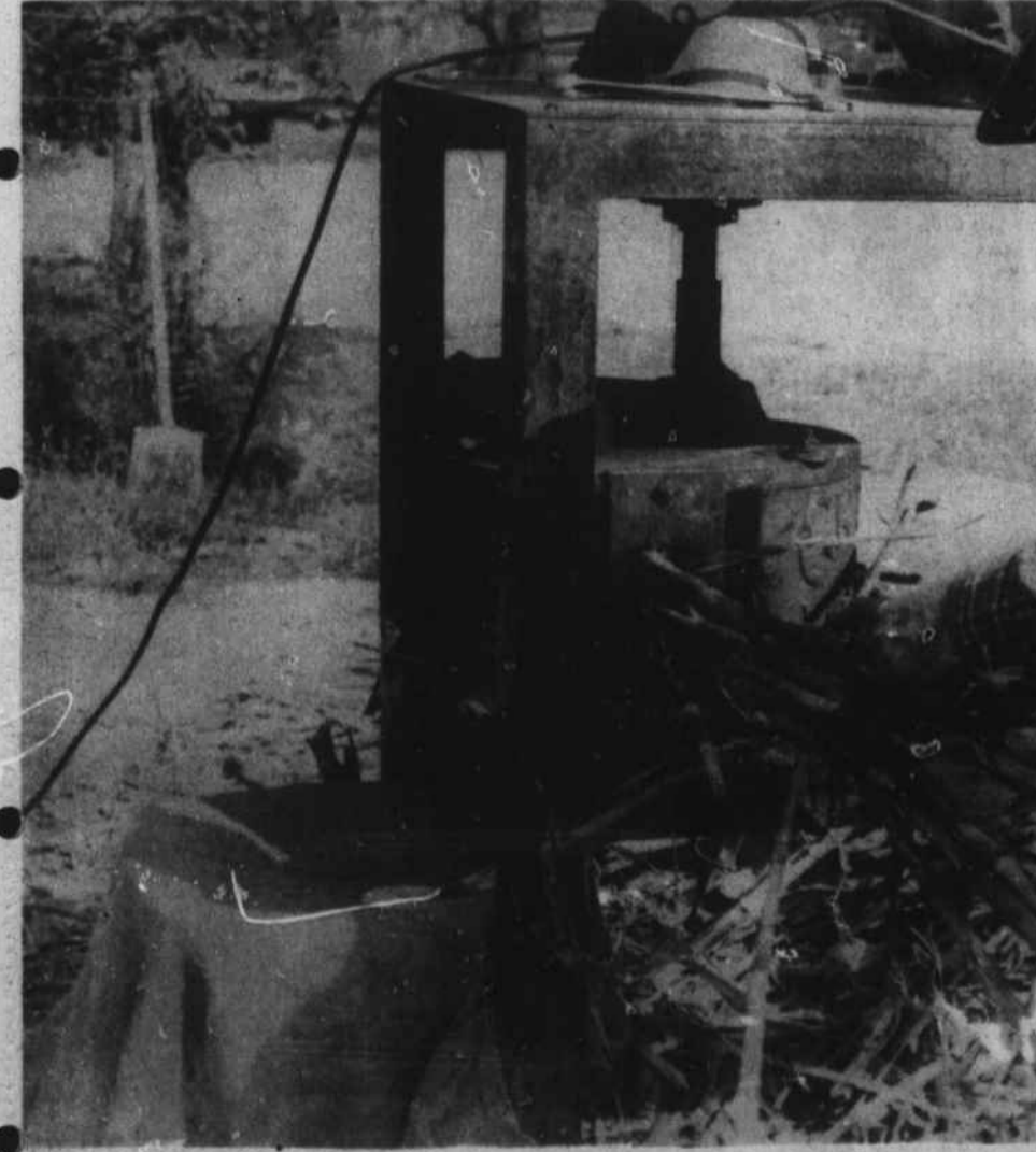
SOME FOLKS THINK COOKING CANE SYRUP IS A SIGN OF HARD TIMES, says Bo Herring. "But it is just a sign of folks wanting some good, old-fashioned, home-grown mopping syrup." Herring is shown here