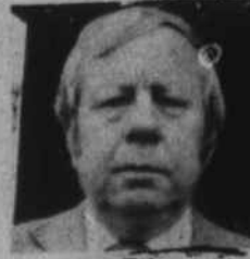
Ethro Hill Highway #11 Pink Hill 568-3310