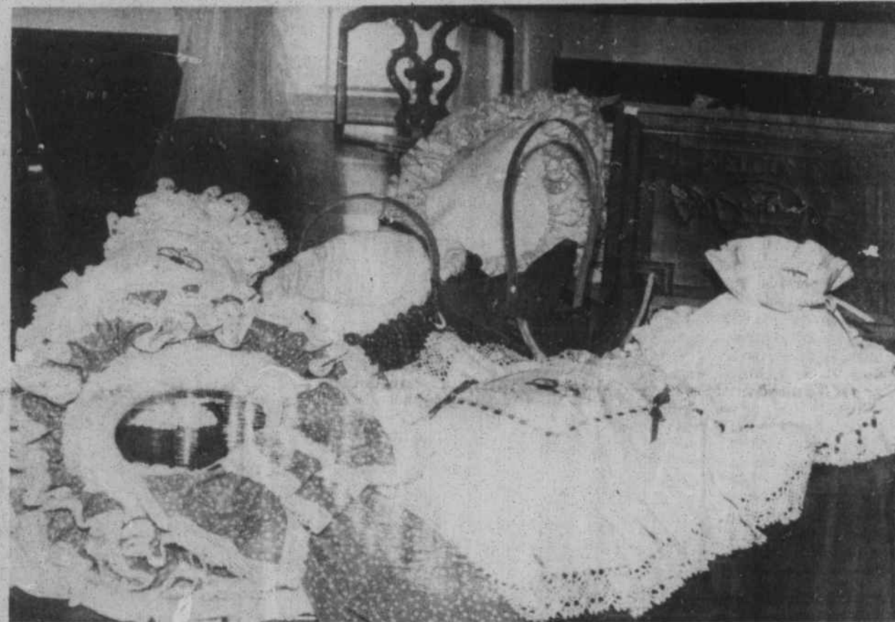
A Sample Of Duplin Crafts Going To Expo '84 In Morehead City.