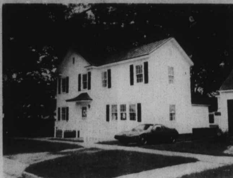
Pink Hill Library