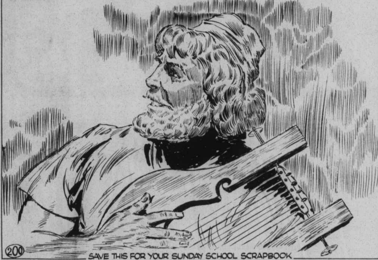
SAVE THIS FOR YOUR SUNDAY SCHOOL SCRAPBOOK

ONE OF THE MEANINGS OF THE NAME DAVID IS "BELOVED." THE SON OF JESSE WAS THE SECOND KING OF ISRAEL. HE WAS THE YOUNGEST OF EIGHT BROTHERS (1 SAMUEL 16:10-11; 17:12-14). MANY OF THE GOOD TRAITS IN DAVID'S CHARACTER WERE, NO DOUBT, INFLUENCED BY HIS MOTHER, WHO WAS KNOWN FOR HER GODLINESS. SOME OF THE PSALMS THAT DAVID WROTE WERE IN REMEMBRANCE OF HIS MOTHER'S DEVOUTNESS. (PSALMS 86:16; 116:16) DAVID'S ANCESTRAL HISTORY WAS PICTURESQUE AND INSPIRING ALTHOUGH, AT TIMES TAINTED BY SINFUL ACTS. (GEN. 37:26-27,38) IN PERSON, DAVID WAS RUDDY AND BEAUTIFUL TO LOOK UPON AND AS THE YOUNGEST SON, HE WAS CHARGED WITH THE DUTY AND CARE OF HIS FATHER'S SHEEP. HIS DISPLAY OF COURAGE IN THIS OCCUPATION, BY SLAYING BOTH A LION AND A BEAR WHICH ATTACKED THE FLOCKS, POINTED UP HIS GREAT BRAVERY. HE WAS ALSO POSSESSED OF MUSICAL GIFTS OF THE HIGHEST ORDER AND HE PLAYED SKILLFULLY ON THE LYRE AND WAS VERY ADEPT AT COMPOSING PSALMS. THESE NATURAL GIFTS WOULD CERTAINLY STAND HIM IN GOOD STEAD WHEN DESTINY BROUGHT HIM TO THE THRONE OF ISRAEL!