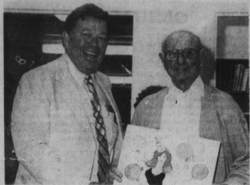
Hoffer Celebrates Birthday

11. State and local laws concerning the installation and location of septic tank systems are being updated periodically. Contact your local health department for assistance with septic tank problems.