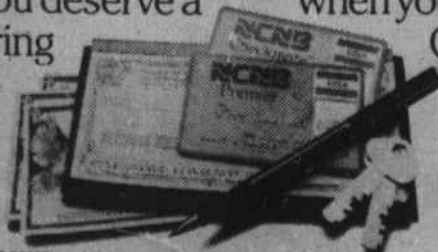
DeLuxe Banking: for $10,000 in a Certificate or $2500 in Regular Savings, nobody puts more muscle in your money.

when you invest $10,000 or more in an NCNB Certificate: DeLuxe Banking.