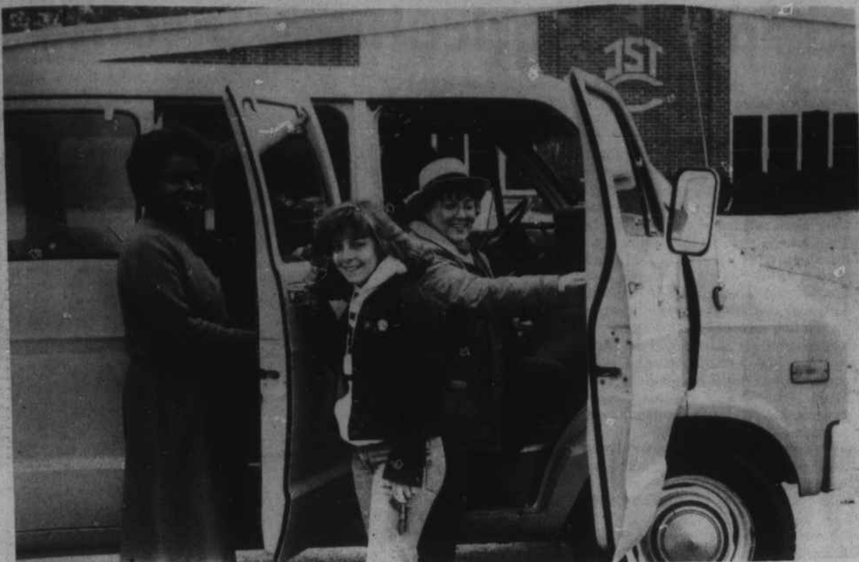
James Sprunt SGA Officers Attend State Conference