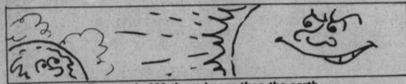
The sun is 110 times larger than the earth.