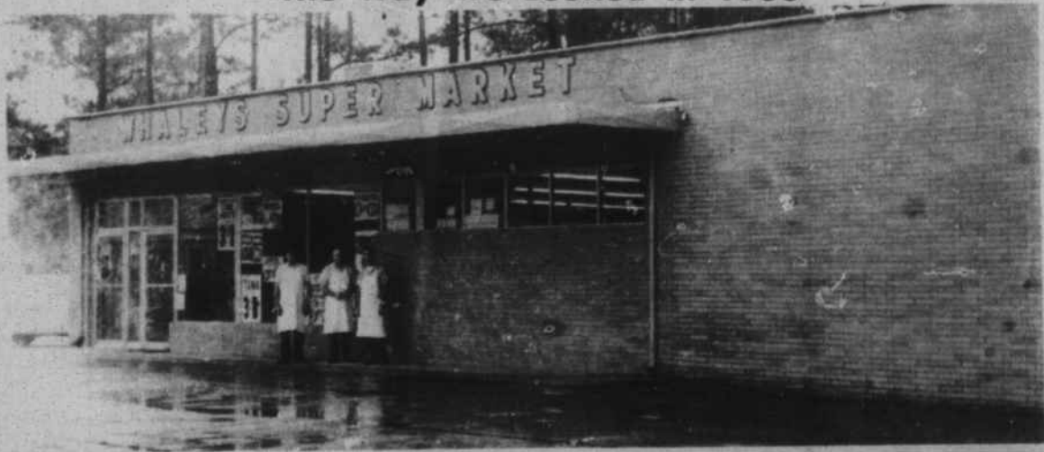
The Way We Looked In 1963