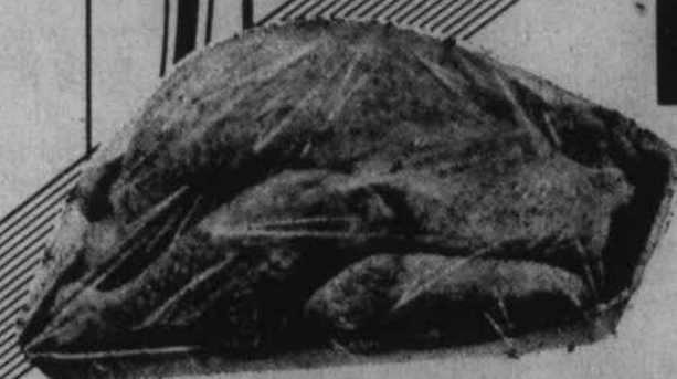
The Way We Looked In 1962