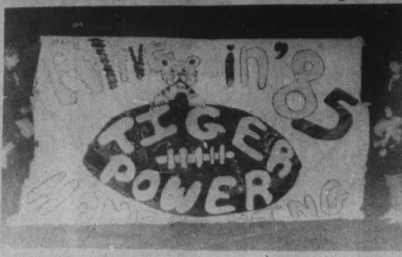
The JK cheerleaders held this sign for the James Kenan Tiger Football Team to break through just before the kick-off of the homecoming game against East Duplin on Friday night. The Tigers won 9-7.