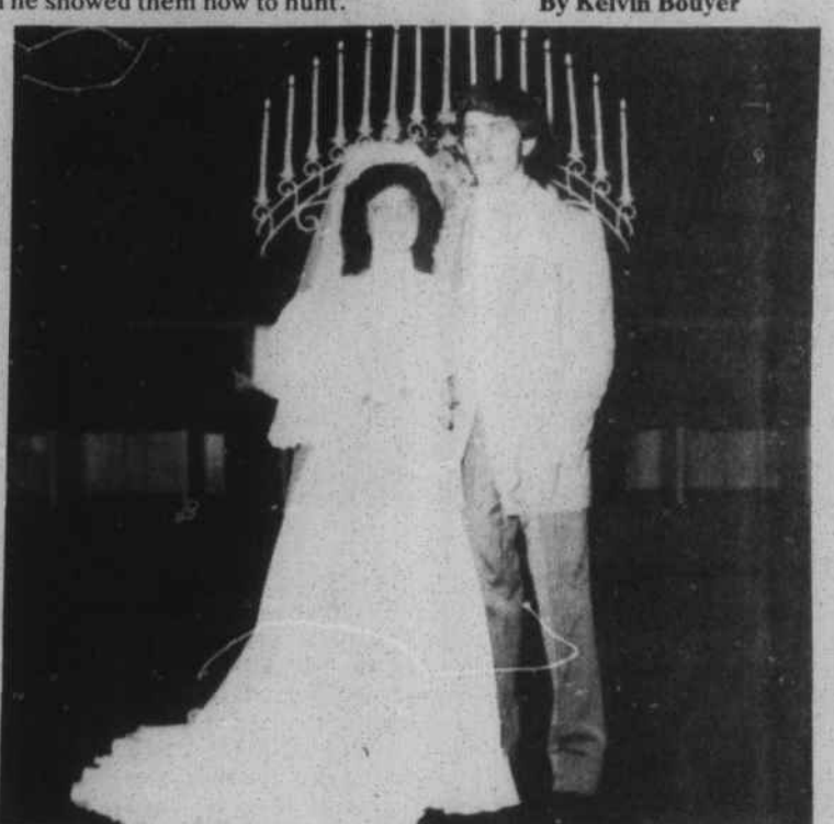
The couple will reside at Route 1,.. Kenansville.