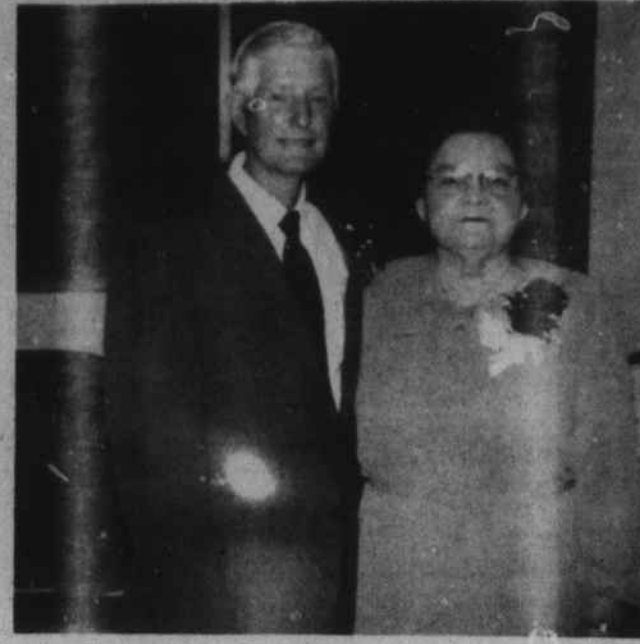
Duprees Celebrate Anniversary