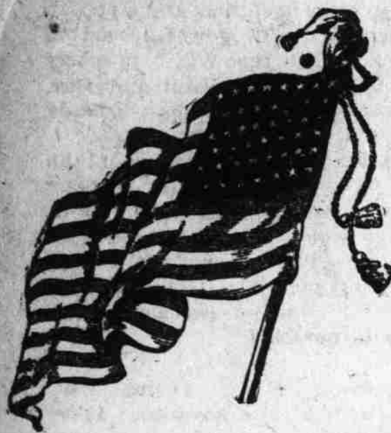
"Long May It Wave."

THE AMERICAN PRESS ASSOCIATION, 235 West 39th Street, New York City, is our sole and exclusive Foreign Advertising Agent.