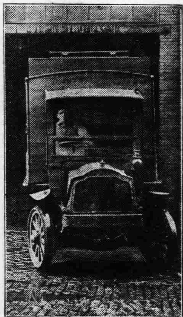
Motortruck is Big Factor in Reducing and Stabilizing Costs.

Those who doubt the possibilities of the highway freight and express as factors in the reduction and stabilizing of food costs are told to look back over the development of the railway and note that the beginning was upon