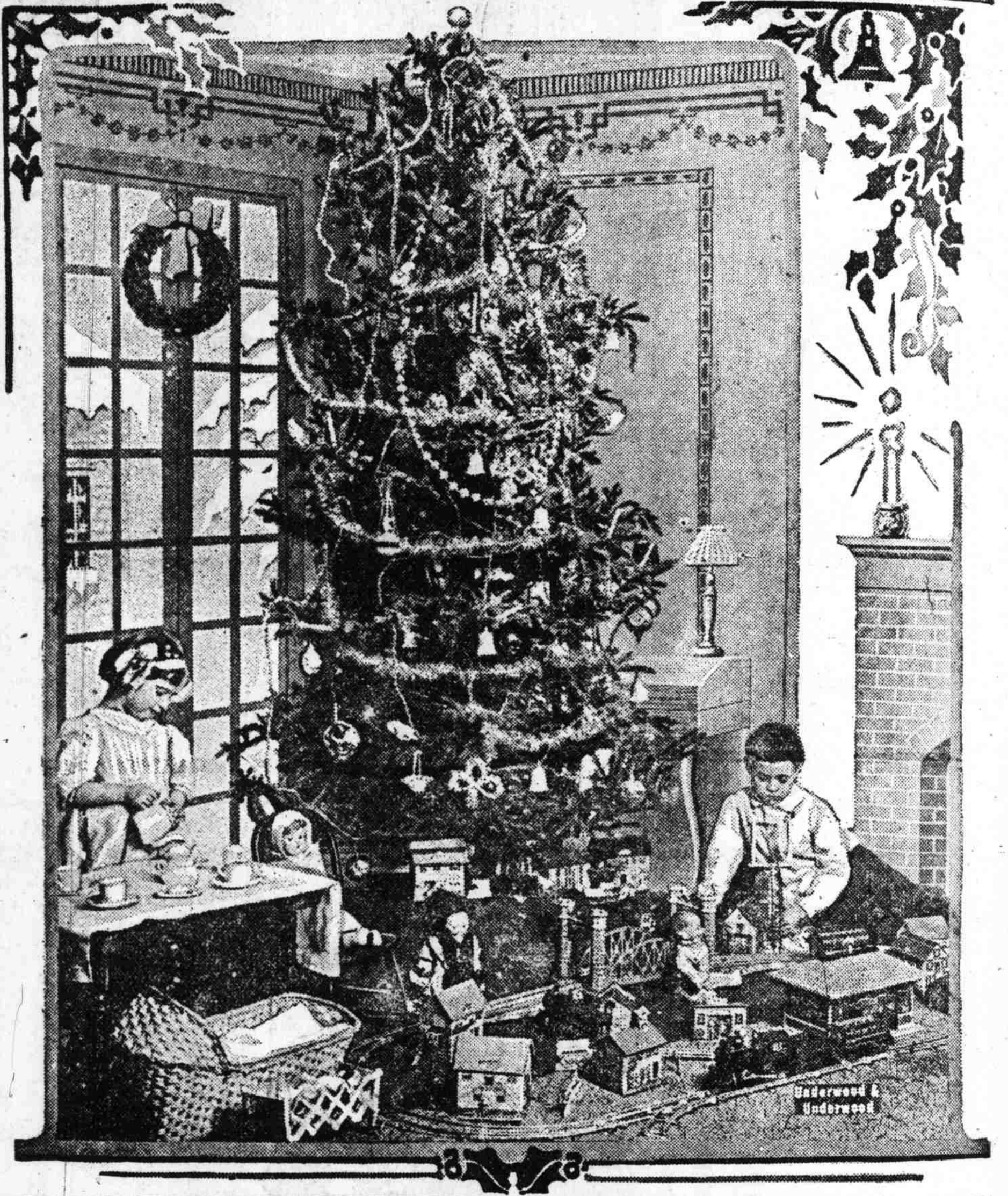
Underwood & Underwood