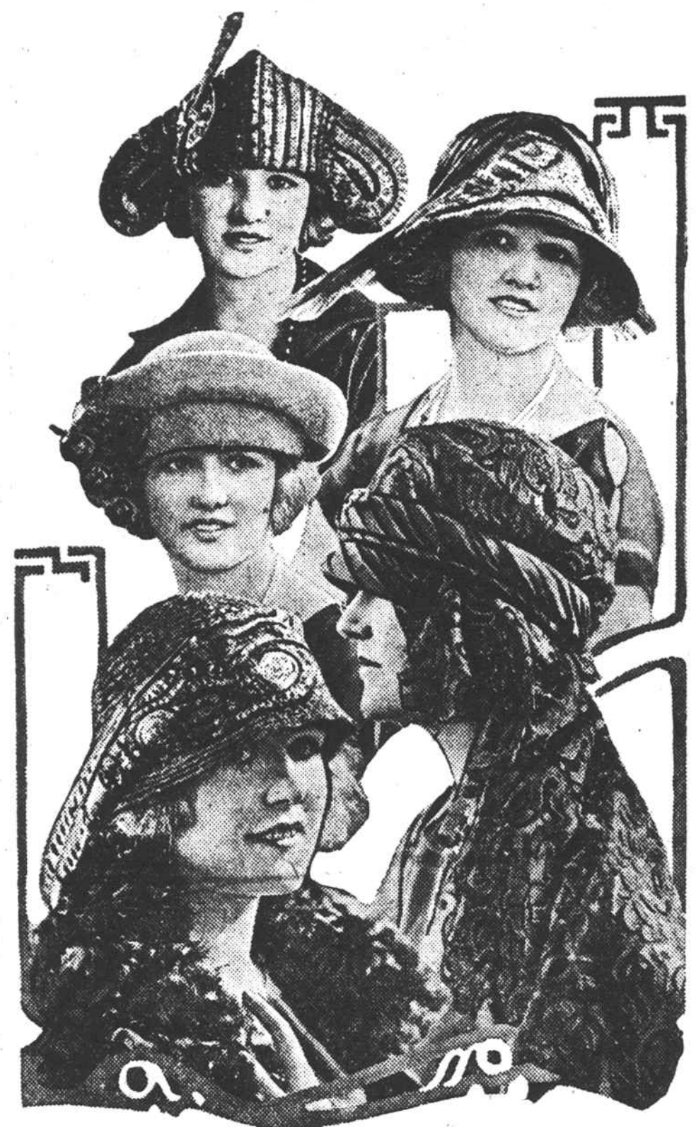
Interesting Group of Hats.

with a pin or a cocarde of lace edging. Another charming item is rococo ribbon, which is a very narrow sort in rainbow colorings. It is this dainty ribbon which is shirred and twirled into curls on the close-fitting bonnet to the left, until the entire shape looks as if it were made of crinkled silk. Oriental colorings are everywhere present in millinery and especially are they featured in printed silks such as are used to drape across the front of the helmet-shaped hat to the right, which is topped with genuine haircloth. A tiara brim with Egyptian motif is