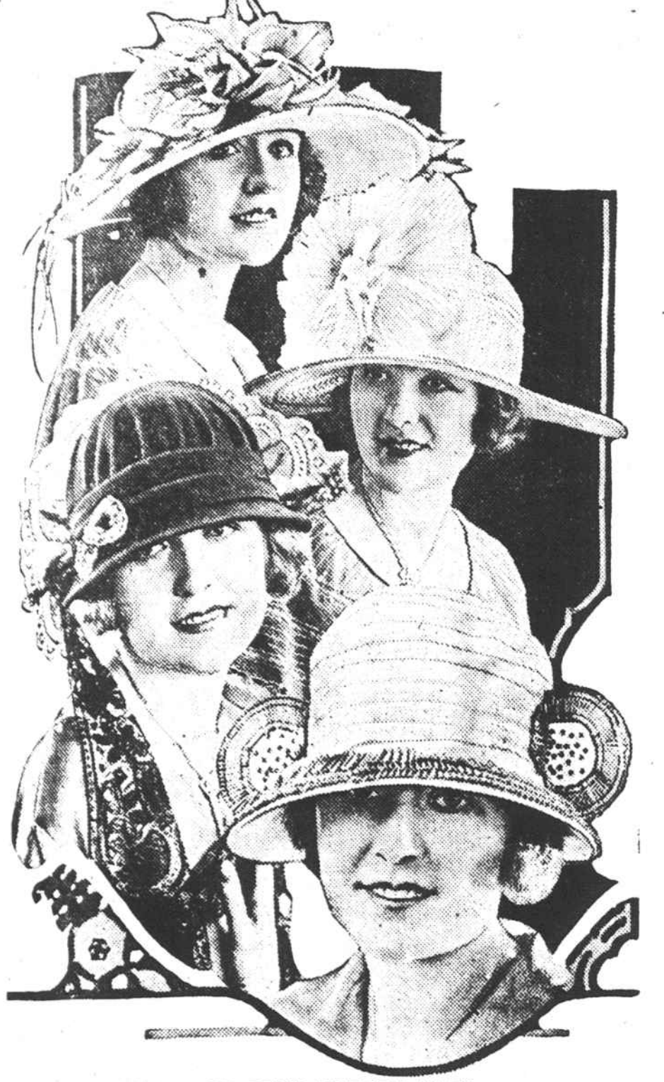
GROUP OF FOUR PRETTY HATS