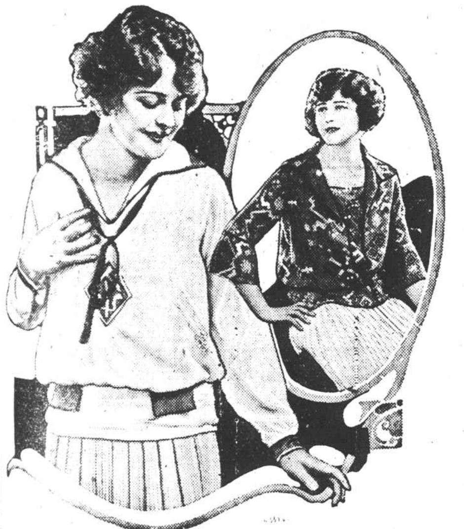
TWO EXAMPLES OF LATEST IN BLOUSES.